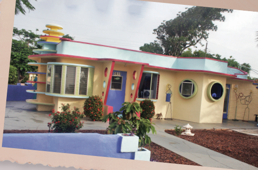
► The Wenger House, built in 1948, Delray Beach