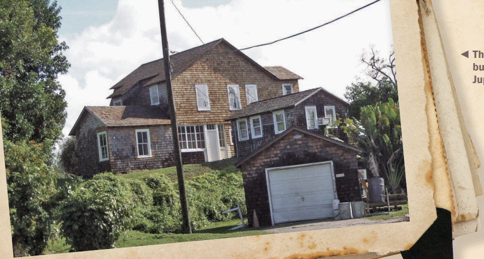
◀ The DuBois House, built in 1898, Jupiter