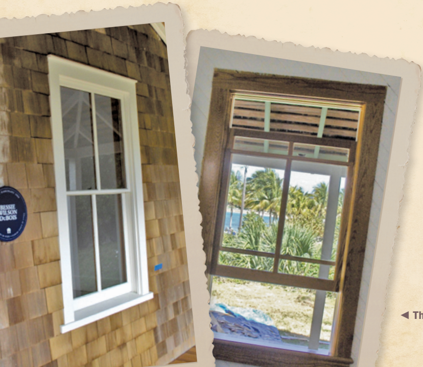
◀ The DuBois House, window replacement