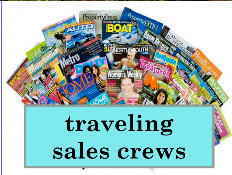
traveling sales crews