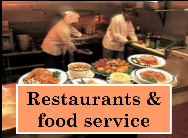
Restaurants & food service