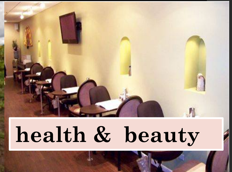
health & beauty